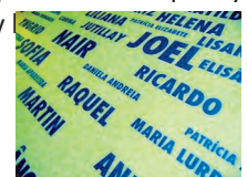
Image of the names of young girls and their children supported by Associação Humanidades